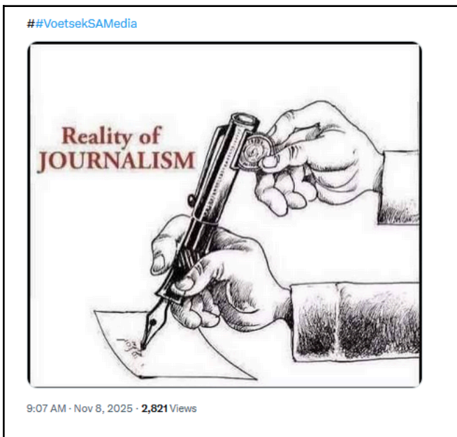
Figure 3: Example of #VoetsekSAMedia post