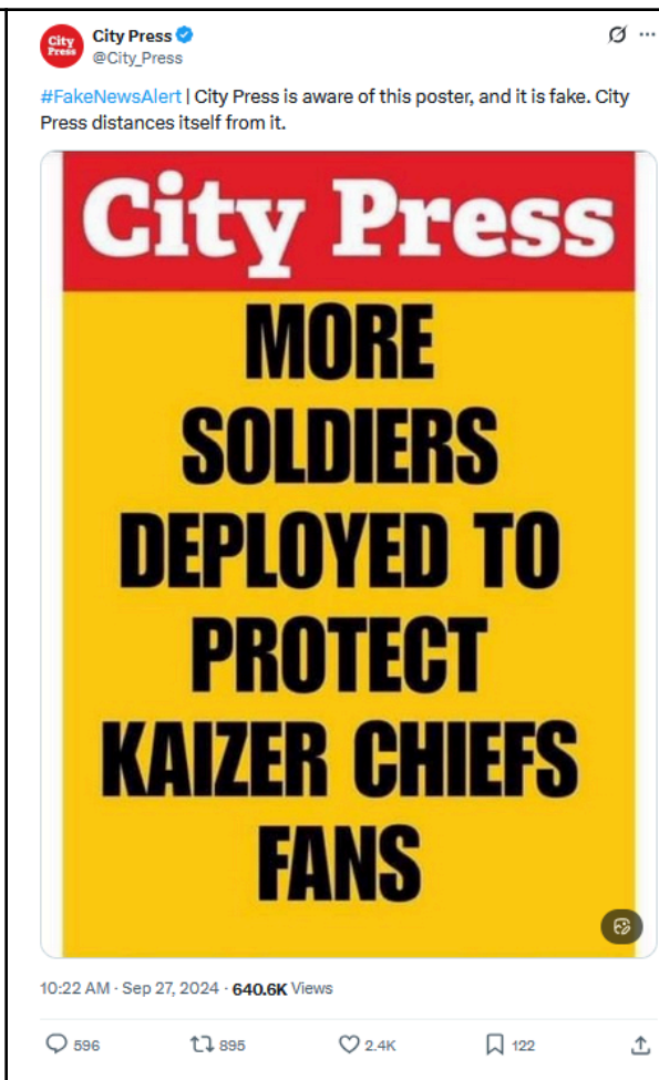
Figure 2: Fake poster