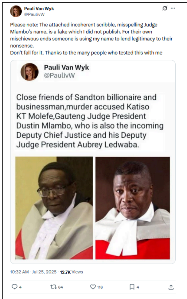
Figure 1: Fabricated screengrab