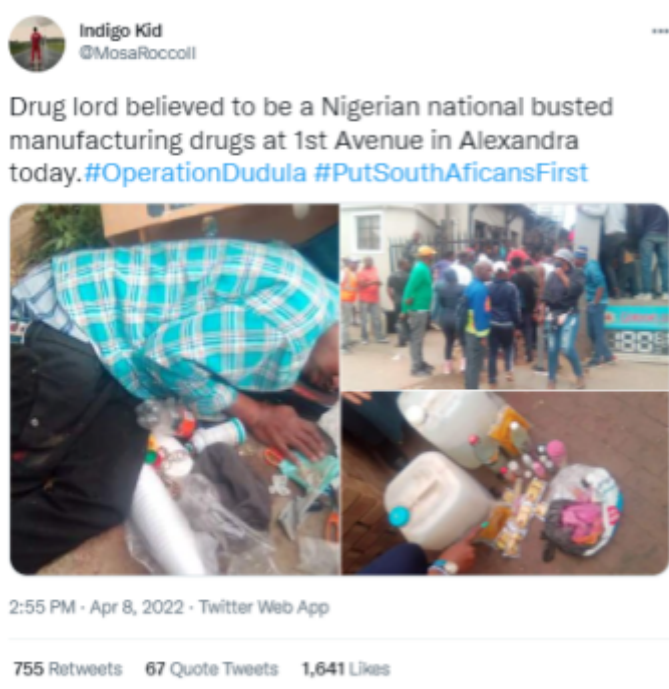
Figure 23: Post about foreigners and drugs

No evidence was offered to prove any of the accusations made in these posts.