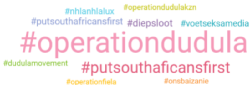
Figure 17: Word cloud showing the top 10 hashtags in conversations about Xenophobia, immigrants and foreigners in South Africa.

Having tried to make sense of the news about the 4 to 7 people that lost their lives in the weekend leading up to protest action in Diepsloot, we took a step back to look through some of the broad themes that were running between 05 and 10 April 2022 to help us better understand the incident or incidents that took place. To do so, we inspected the hashtags that were trending within posts about xenophobia, foreigners and immigrants. Figure 17 below shows the top 10 hashtags that were analysed. The size of the word in the image indicates its volume relative to the surrounding hashtags.