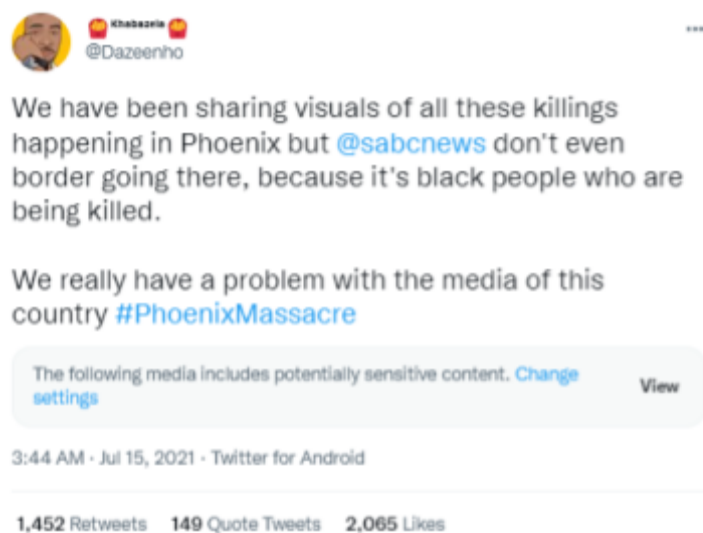
Figure 21: Media criticism during July unrest. a