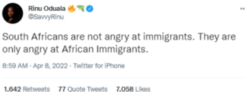
Figure 6: Post claiming South Africans are only angry at African immigrants

image of the graphic content that was shared on SABC news about Nyathi's death and referred to the act as Afrophobia. Professor Jonathan Moyo is Zimbabwe's former Minister of Higher & Tertiary Education, Science & Technology Development. Reflecting this thought, the Project Director of social advocacy group Content Hub NG tweeted "South Africans are not angry at immigrants. They are only angry at African immigrants" (Figure 6). This post shown in Figure 6 post received more than 7 000 likes and over 1 600 retweets. These figures are far higher than the posts that were used to amplify hashtags like #operationdudula and #putsouthaficansfirst (misspelt in the data). If one bears in mind that one account can only like or retweet a post once, it would imply that more unique Twitter account holders resonated with the type of message in Figure 6 than they did with the content that was being amplified in a more coordinated way about Operation Dudula and Elvis Nyathi.