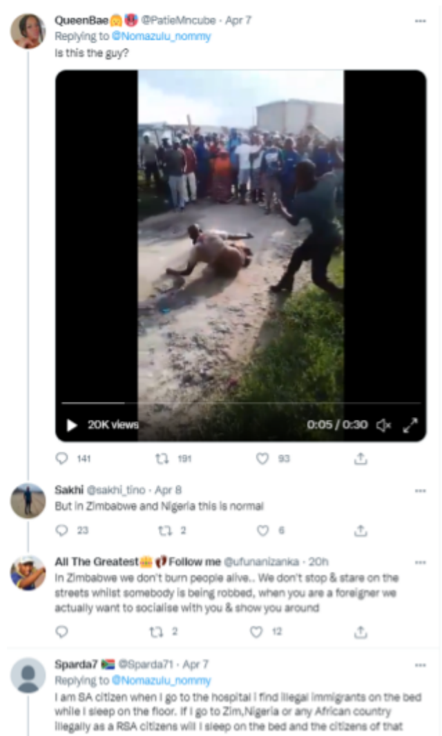
Figure 11: Comment with the video of a man set alight and beaten.