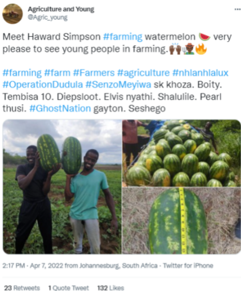
Figure 5: Post containing Tembisa 10. b

Using open source research techniques, we were able to see that the Tembisa 10 trend appeared on the day that SANEF labelled the story of the Tembisa 10 as ludicrous and an embarrassment to South African journalism. From Figure 4 and Figure 5 it is clear that the keywords were not used like hashtags #OperationDudula or #Senzomeyiwa. This may be done to manipulate the Twitter algorithm that groups content based on the keywords.