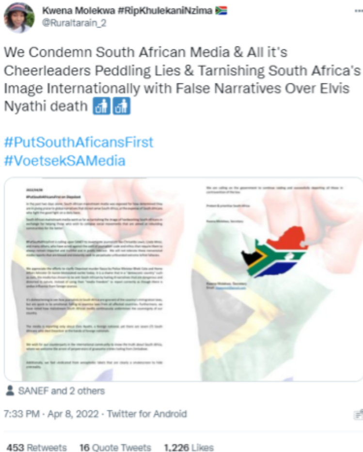
Figure 20: Media criticism. c

This criticism toward the media that claims certain media houses are not covering important stories as they unfold is something that we have seen take place during the July unrest period in KwaZulu-Natal. Messages like those shown in Figures 21 and 22 below are examples of such posts from July 2021.