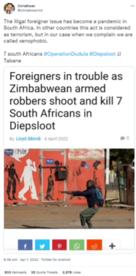
Figure 15: Post claiming that 7 South Africans were killed by foreigners

As there was a distinct anti-EFF and anti-foreigner sentiment to these posts, we decided to turn to news media sites to determine what was being reported about 7 lives that were allegedly lost.