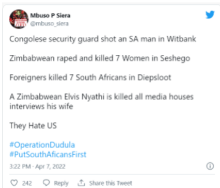
Figure 28: Post claiming that 7 women were raped by foreigners