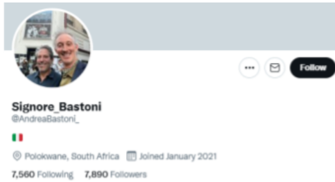
Figure 9: Account with Italian flag that tweets mainly SA content