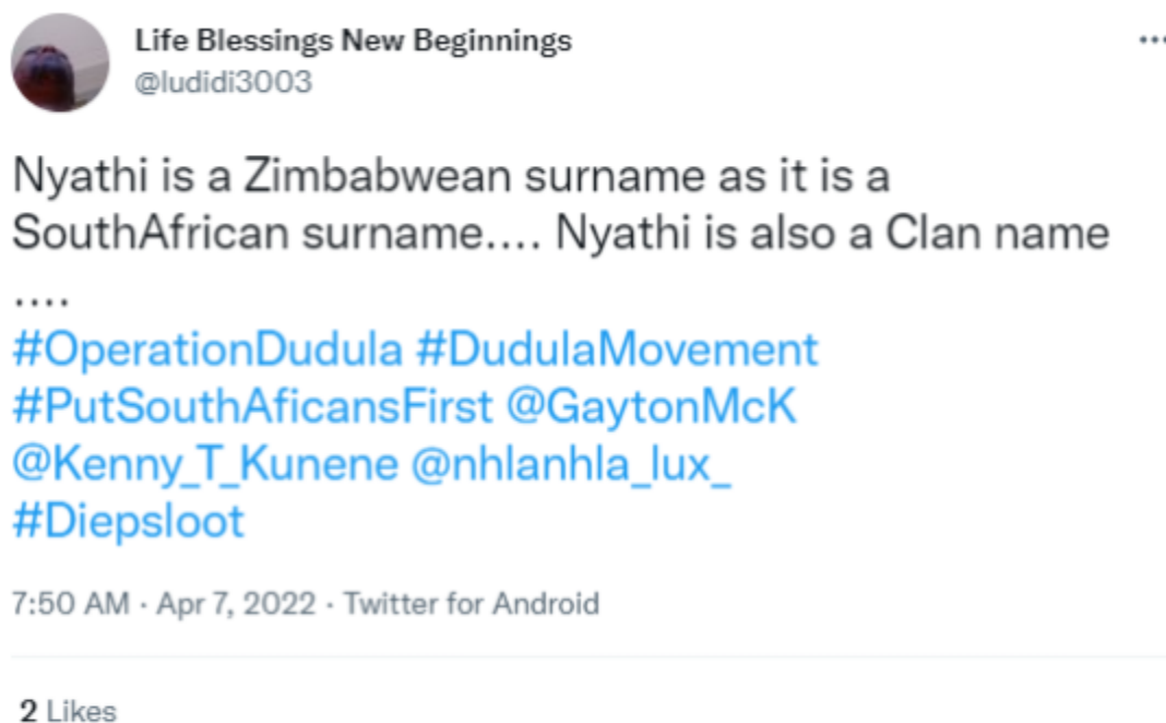
Figure 2: Post claiming that Nyathi is a clan name

The earliest reference to the name on Twitter that was available to us was at 07:50 on 7 April 2022. It was found in a post that claimed Nyathi is a clan name used in both South Africa and Zimbabwe (Figure 2). This information was shared along with #operationdudula #dudulamovement and #putsouthaficansfirst.