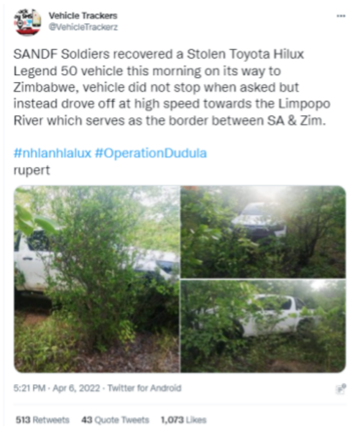
Figure 27: Recovery of stolen vehicle allegedly on its way to Zimbabwe