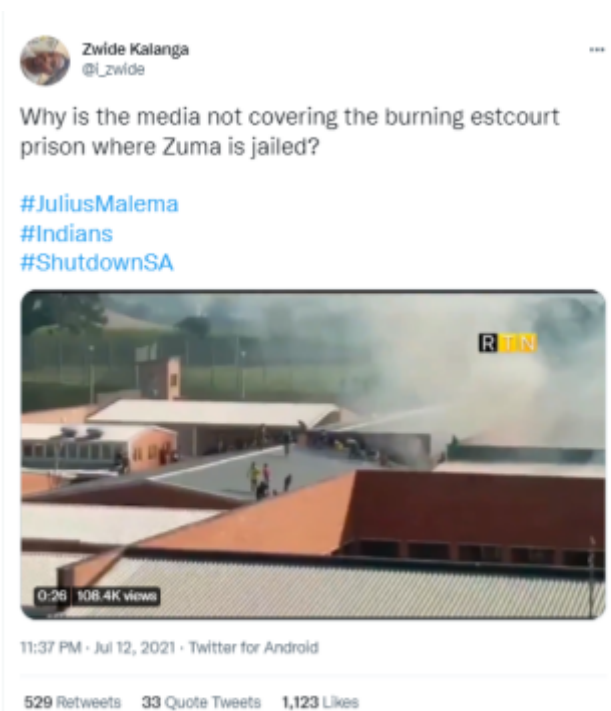
Figure 22: Media criticism during July unrest. b

A free and unbiased media is one of the hallmarks of a democratic society. While it is important to remain critical of the media and how it reports the news, deliberately undermining the media as dishonest or engaged in deliberate conspiracies to mislead the citizenry is detrimental to