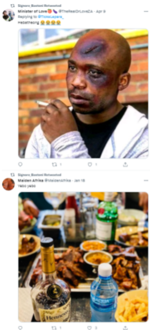
Figure 10: Bastoni account posting South African content