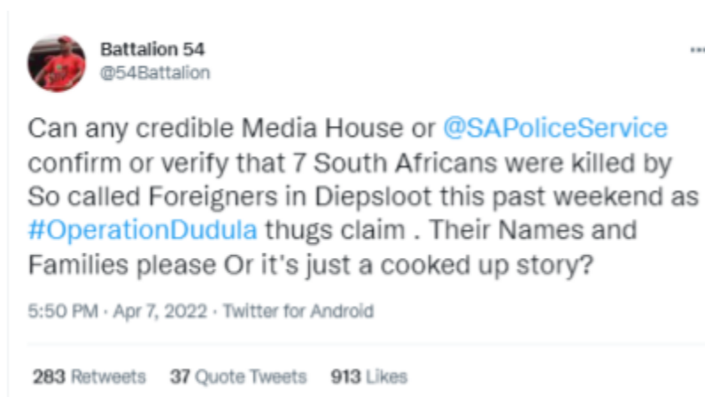
Figure 16: Call from online EFF supporter requesting an investigation into the alleged death of 7 South Africans at the hands of foreigners in Diepsloot.

A digital response to these claims from an account associated with the EFF asked for an investigation into the news to ensure that the story hasn’t been cooked up (Figure 16).